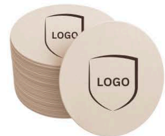
Coaster 3,000 Pieces (6 Mo)