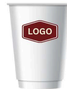
Soda Cup 10,000 Pieces (12 Mo)