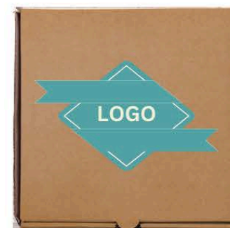
Pizza Box 4200 Pieces (12 Mo)