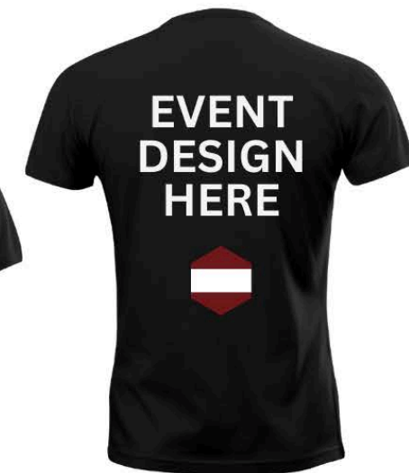
Exclusive Back Logo