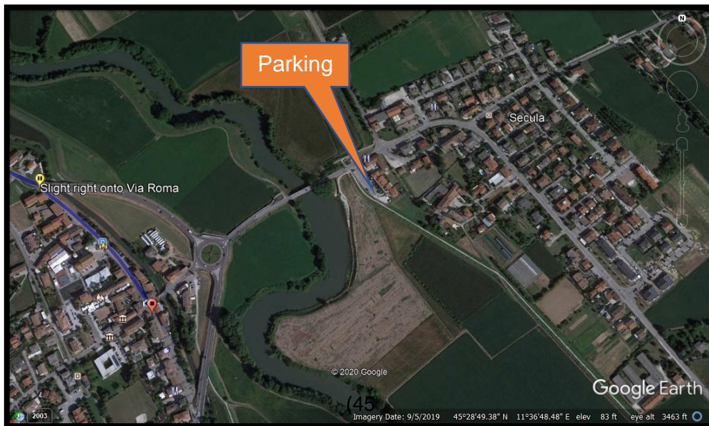
Figure 1 Grid Location (45°28'49.38" N 11°36'48.48" E)

(2) (Zone B): Bacchiglione River, Longare