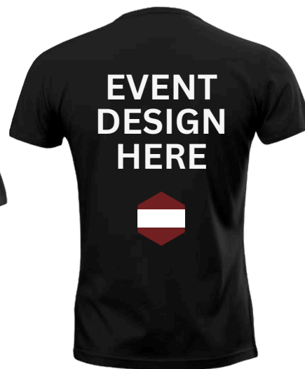
Exclusive Back Logo