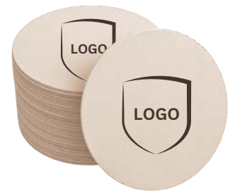
Coaster 3,000 Pieces (6 Mo)