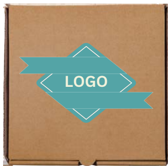
Pizza Box 4200 Pieces (12 Mo)