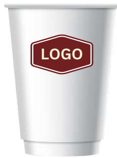
Soda Cup 10,000 Pieces (12 Mo)