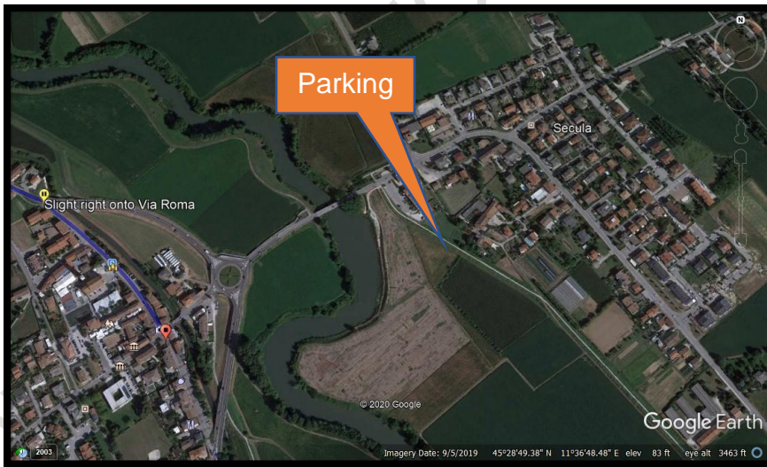
Figure 1Grid Location (45°28'49.38" N 11°36'48.48" E)

(2) (Zone B): Bacchiglione River, Longare